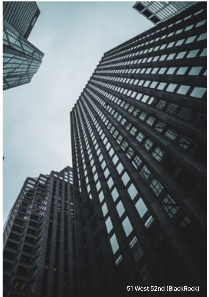
51 West 52nd (BlackRock)