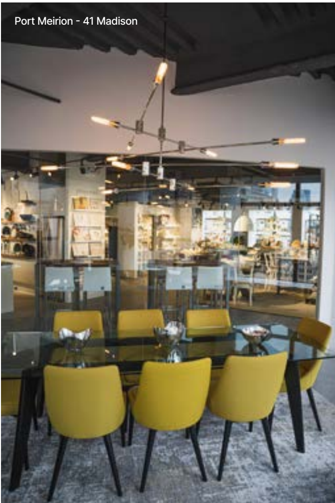
Port Meirion - 41 Madison