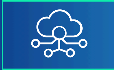
IoT & PoE-enabled software